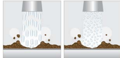
While pellets are most suitable when removing heavy, thick contaminants, shaved ice is ideal for cleaning delicate substrates, intricate geometries or tiny openings.