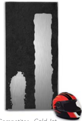
Competitor Cold Jet

Aero Systems clean uniformly on every pass making them the fastest dry ice blast cleaning system available on the market.