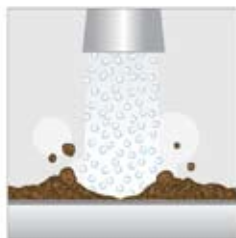
While pellets are most suitable when removing heavy, thick contaminants, shaved ice is ideal for cleaning delicate substrates, intricate geometries or tiny openings.