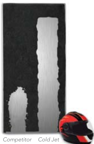
Competitor Cold Jet

The automatic tilt-out hopper, standard on the Aero 80-HP and 80-DX, allows you to quickly empty and clean the hopper, and save unused dry ice.