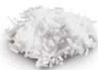
The Aero line uses rice-sized dry ice pellets to effectively clean without damage or secondary waste.

Aero Systems clean uniformly on every pass making them the fastest dry ice blast cleaning system available on the market.