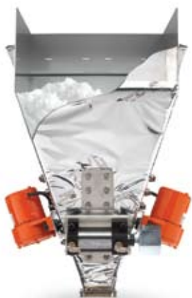
Patented Isolated Hopper with Advanced Agitation Technology.